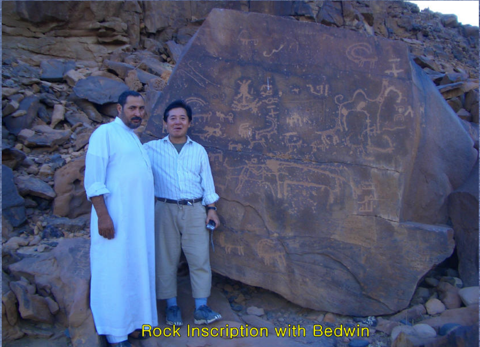
Rock Inscription with Bedwin